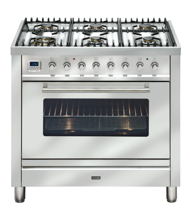
Pictured: NT906WMP/I Cooker in Stainless Steel

ILVE uses our own burner design. Production of the Venturi is horizontal, as used in the professional cookers. The primary air can be adjusted meaning the cooktop can be used with all types of gas. The air:gas ratio is optimised and the flame can be adjusted. This has a great positive impact in lower emission of CO (carbon monoxide) gasses well up to 1/100 compared with the reference standard. ILVE brass burners combine technical precision with performance. Our new Triple ring design guarantees scorching heat is achieved in an instant. Great for Wok cooking, boiling and grilling.