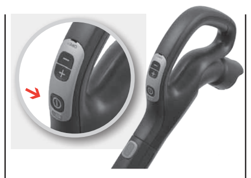
Models with remote control can also be operated by the (ON/OFF) () button on the handle.