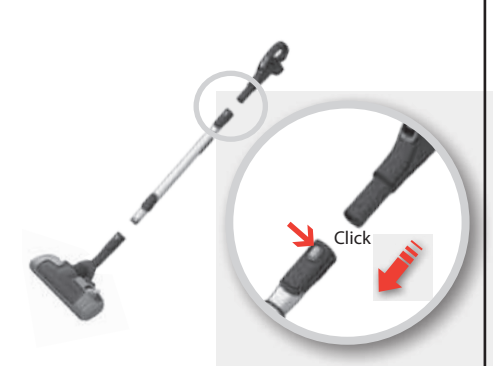
Attach the telescopic tube to the hose handle (to remove it, press the release button and pull the hose handle out).