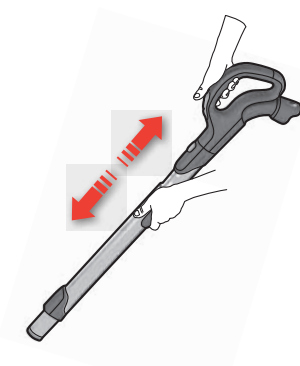
Adjust the telescopic tube by holding the lock and pull the handle with the other hand.