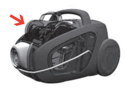
Ensure that the dust container and foam filter are in place!