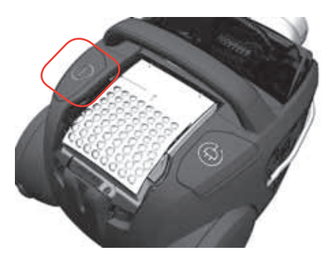
Switch on/off the vacuum cleaner by pushing the ON/ OFF button.