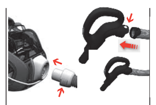
Insert the hose (to remove it, press the release buttons and pull the hose out).

Insert the hose into the hose handle until the catches click to engage (press the catches to release the hose).