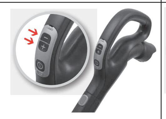
Adjust suction power. (Models with remote control.) To regulate press " – " button (decrease) or " + " button (increase)