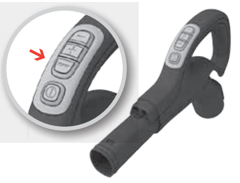
Models with remote control and AeroPro motorized nozzle . To turn the motorized nozzle on and off, press BRUSH button on the handle. The indicator light on the nozzle will come on when BRUSH is operating.