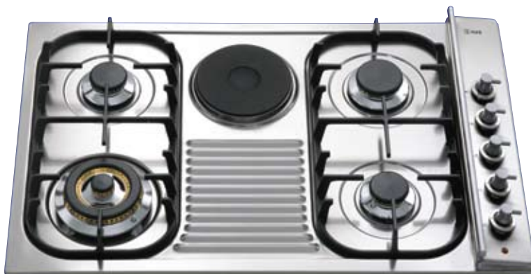
H 381 C