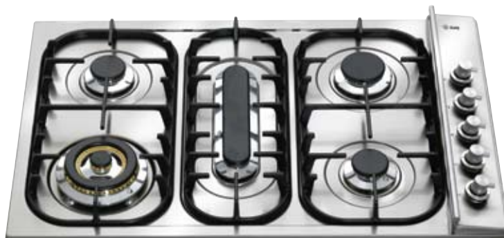
H 38 PC