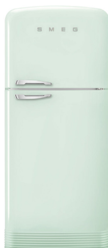
FAB50RPG5AU Pastel Green