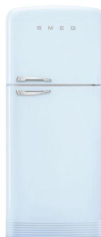
FAB50RPB5AU Pastel Blue