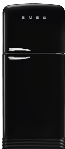
FAB50LBL5AU FAB50RBL5AU Black