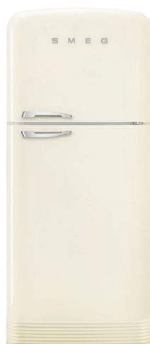
FAB50LCR5AU FAB50RCR5AU Cream