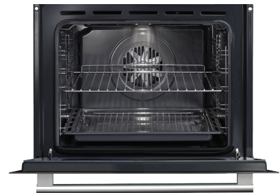
ULTRA-Clean smooth cavity

Our new ULTRA-Clean light grey, nickel-free enamel interior reduces the toxicity of materials in contact with foods and is easy to clean. ILVE's Tangential Ventilation System (TVS) smartly circulates air around the oven to ensure protection of your kitchen cabinets. Standard in the oven are Telescopic racks and are totally removable making the use of the ovens baking trays and general cooking in the oven easy and effortless. The Full size inner door glass provides a panoramic view from the outside of the oven door of what is inside the oven, its full width also enables easy cleaning with no crevices for food scraps and residue to get trapped.