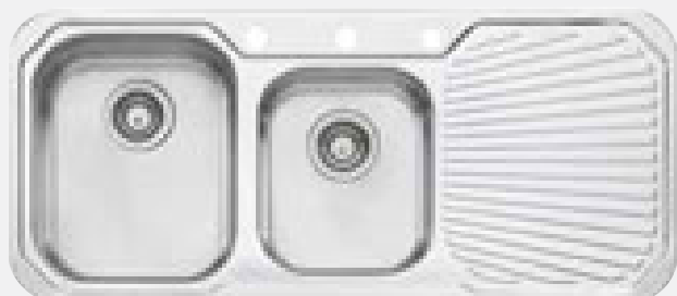
LEFT HAND BOWL SINK