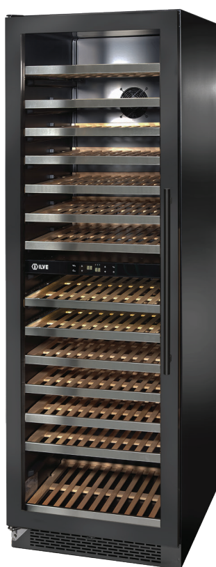
Pictured: ILWD154BVL (Left Hinge)

The ILVE Wine Cellars make for an impressive addition to your ILVE collection. Allowing you to store wine in an optimum humidity and temperature controlled environment, boasting an impressive array of features with the sleek look that is signature of ILVE appliances.