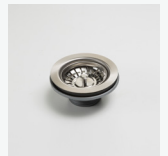
AC14 Basket Waste