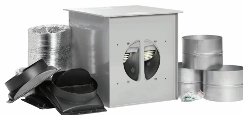
Full installation kit included

2 Lengths of ducting 1.5 m + 2.5 m lengths