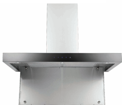
Hinged filter access panel