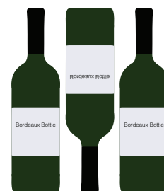
Capacity based on Bordeaux Bottles