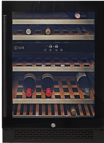
ILWD37BVR Black glass, right hand hinge pictured