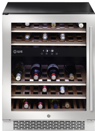
ILWD37XL Stainless steel, left hand hinge pictured