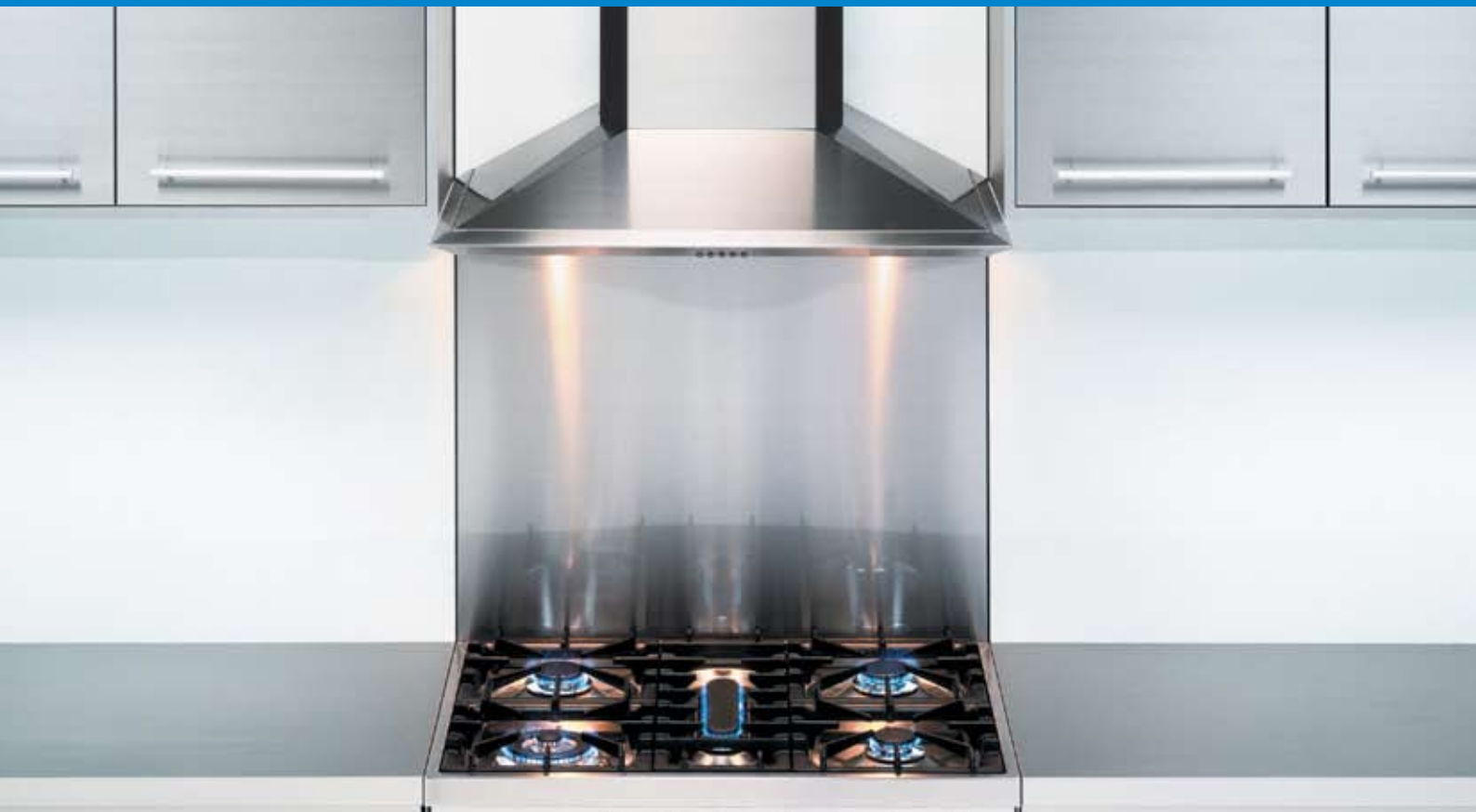
Pictured: Cooker P 80 WMF • SB80 Splashback • X200 Hood

Splashback without Ladle Bar available in: