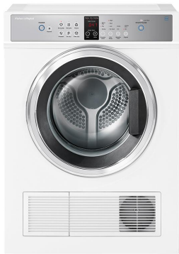
DE6060G1 6kg Vented Dryer

This generous 6 kg dryer has 6 cycles to choose from and a simple SmartTouch™ fascia. With the ability to vent out the front or back via a tube and an easily inverted fascia, installation options are many and easy with a wall mounting kit included. Designed to match Fisher and Paykel Top and Front Load washers.