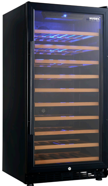
Black Trim Shown