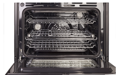
ULTRA-Clean smooth cavity