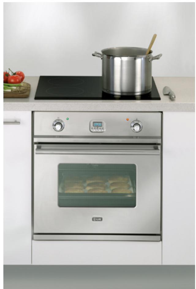
Pictured: • 600WMP Oven • HVI60TC Cooktop

ILVE's 60cm and 90cm induction cooktops are for people who have been thinking about upgrading their cooktop at home but aren't able to go gas, ILVE's induction systems are the ultimate alternative. Unlike normal electric cooktops, induction technology produces heat by creating a magnetic field which generates heat directly to the cooking vessel. This means that the heat is instantaneous, temperature control is immediate and the heat is evenly spread over the bottom of the pan, meaning no more annoying hot or cold spots, the ILVE induction elements also include booster zones to minimize heat up times even further.