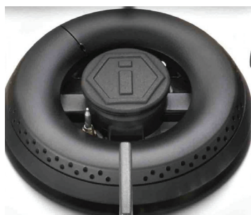
Pictured: ILVE Brass Burner

With ILVE Gas Cooktops, you can simmer at the lowest temperatures that your recipe calls for or go to searing heat instantly. With infinite precision heat settings you'll have perfect cooking control. Cleaning is easy! There are fewer food trapping cracks and crevices allowing for easy wipe maintenance. The trivets, burner caps and supports are removable and easily cleaned either in a dishwasher or by hand. A stainless steel finish ensures this cook top will co-ordinate beautifully with the design of other ILVE appliances. ILVE have maintained their core values as a family owned business and continue to manufacture appliances that represent the most pure thing in a family – dinner time! The kitchen is, and should always be, a place and a time where the family meets and shares.