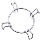
GRW Wok support