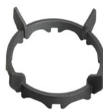
WOKGHU Cast-Iron WOK Support