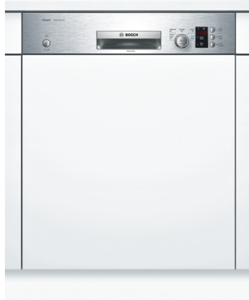
SMI50E45AU Stainless steel semi-integrated dishwasher