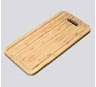
B20.42 chopping board