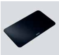
G21.40 black chopping board