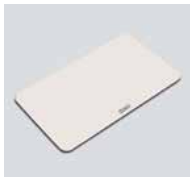
G21.40 white chopping board