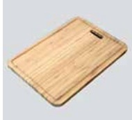
B30.42 chopping board