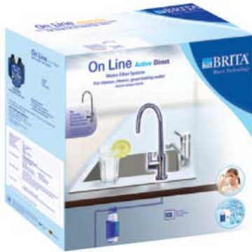
On Line Active Direct Kit

For cleaner, clearer, great tasting filtered water, instantly from the dedicated dispenser.