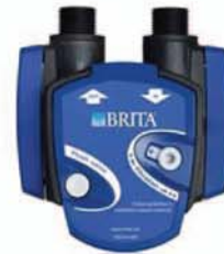
Filter Head for easy filter exchange