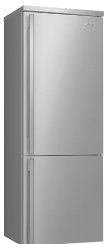
FA490RXAU Stainless Steel