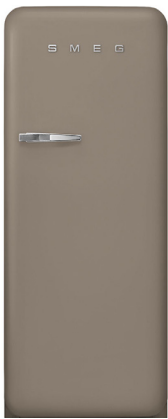
FAB28 Taupe RH | FAB28RDT3 LH | FAB28LDT3