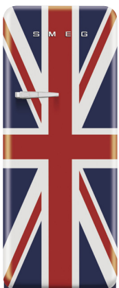
FAB28 Union Jack RH | FAB28RDUJ3 LH | FAB28LDUJ3