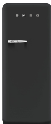
FAB28 Velvet RH | FAB28RDBLV3 LH | FAB28LDBLV3