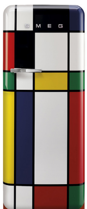
FAB28 Multicolor RH | FAB28RDMC3 LH | FAB28LDMC3