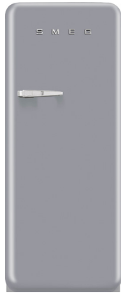
FAB28 Silver RH | FAB28RSV3 LH | FAB28LSV3