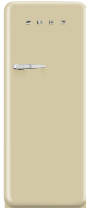
FAB28 Panna (cream) RH | FAB28RCR3AU LH | FAB28LCR3AU