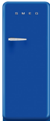
FAB28 Royal Blue RH | FAB28RBE3 LH | FAB28LBE3