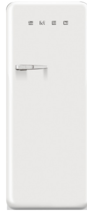
FAB28 White RH | FAB28RWH3AU LH | FAB28LWH3AU