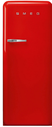
FAB28 Red RH | FAB28RRD3AU LH | FAB28LRD3AU