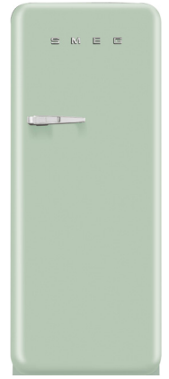
FAB28 Pastel Green RH | FAB28RPG3AU LH | FAB28LPG3AU