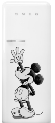
FAB28 Mikey Mouse RH | FAB28RDMM4 LH | FAB28LDMM4