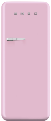
FAB28 Pink RH | FAB28RPK3 LH | FAB28LPK3