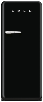
FAB28 Black RH | FAB28RBL3AU LH | FAB28LBL3AU