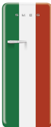
FAB28 Italian Flag RH | FAB28RDIT3 LH | FAB28LDIT3