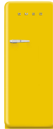
FAB28 Yellow RH | FAB28RYW3 LH | FAB28LYW3