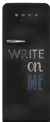
FAB28 Black Board RH | FAB28RDBB3 LH | FAB28LDBB3