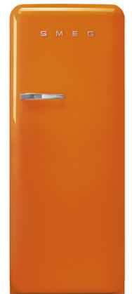
FAB28 Orange RH | FAB28ROR3 LH | FAB28LOR3