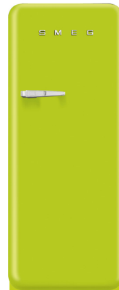
FAB28 Lime Green RH | FAB28RLI3 LH | FAB28LLI3