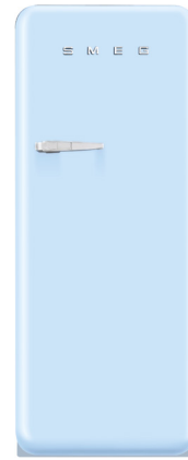
FAB28 Pastel Blue RH | FAB28RPB3AU LH | FAB28LPB3AU