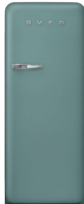
FAB28 Emerald Green RH | FAB28RDE3 LH | FAB28LDE3