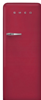
FAB28 Ruby Red RH | FAB28RDRB3 LH | FAB28LDRB3