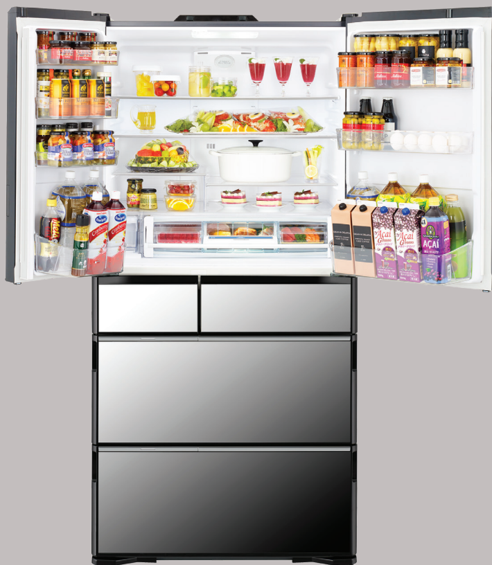
R-ZX740RA X Mirror Glass