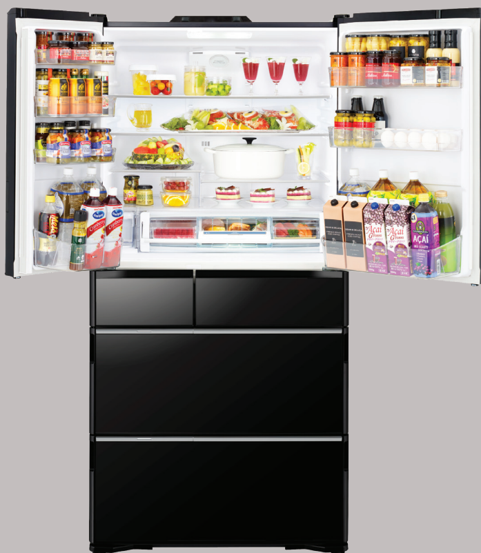
R-ZX740RA XK Black Glass