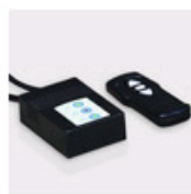
Control Equipment & Accessories