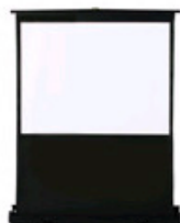
Vertical Up Screen