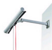
Pivot & Tilt Screen