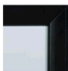
Fixed Frame Screen