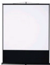
Floor Stand Screen