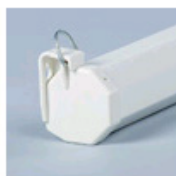
Manual HT Screen