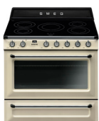
Panna (Cream) TR90IP9