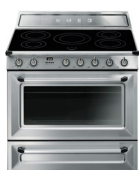
Stainless Steel TR90IX9