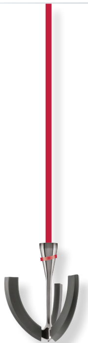
FLEX EDGE BEATER