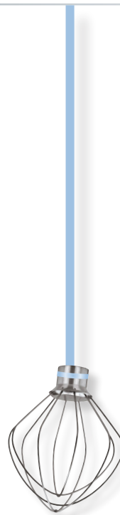
NEW WIRE WHISK