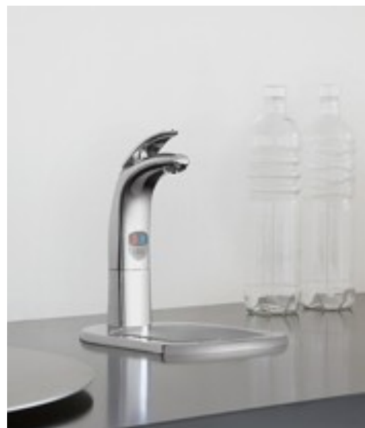
Standard dual temp dispenser