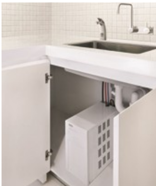
Underbench boiling and ambient module