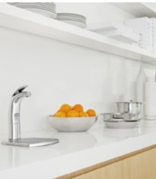
Dual temp dispenser pictured on optional Font