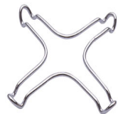
GRM Gas hobs moka support