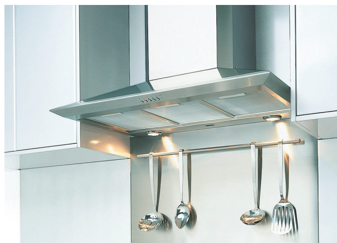
Pictured: • XR400-90 90cm Canopy Range Hood