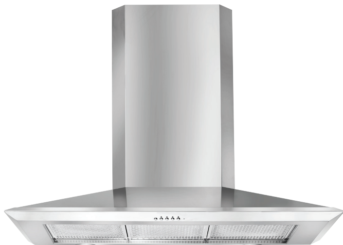
Pictured: • XR400-90 90cm Canopy Range Hood

Incorporating all the features as the X400 Hood, the XR400-90 Remote motor hood reduces the noise in the kitchen by up to 70%. At ILVE, we are dedicated to creating quiet range hoods with maximum performance via the use of a remote extraction system, in which motor is located separate to the hood body ( i.e. in the ceiling). By doing this, the noise is reduced rapidly. Both the installation methods of the motor; in the roof (Silent Split Exterior) or in a false ceiling (Silent Split In-line) for example is designed for ease of installation based on your individual needs. In-built LED Lights produce a natural brightness, illuminating your cooking area while the streamlined electronic control panel ensures whisper quiet air extraction is at your fingertips. Either as a visual focal point or discreetly integrated, it is easy to see that ILVE Rangehood's are built to extract!