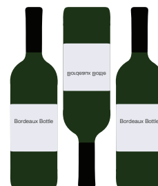
Capacity based on Bordeaux Bottles