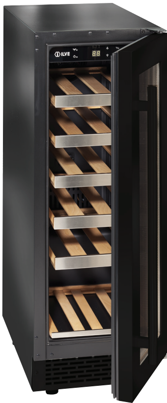
Pictured: ILWS18BV (Right Hinge)

The ILVE Wine Cellars make for an impressive addition to your ILVE collection. Allowing you to store wine in an optimum humidity and temperature controlled environment, boasting an impressive array of features with the sleek look that is signature of ILVE appliances.