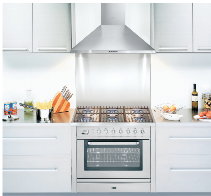
Pictured: • IVG40-90 Canopy Rangehood • T906 LMP Cooker

Functionally simple to use and a breeze to cook with, ILVE is truly the next generation in cooking.