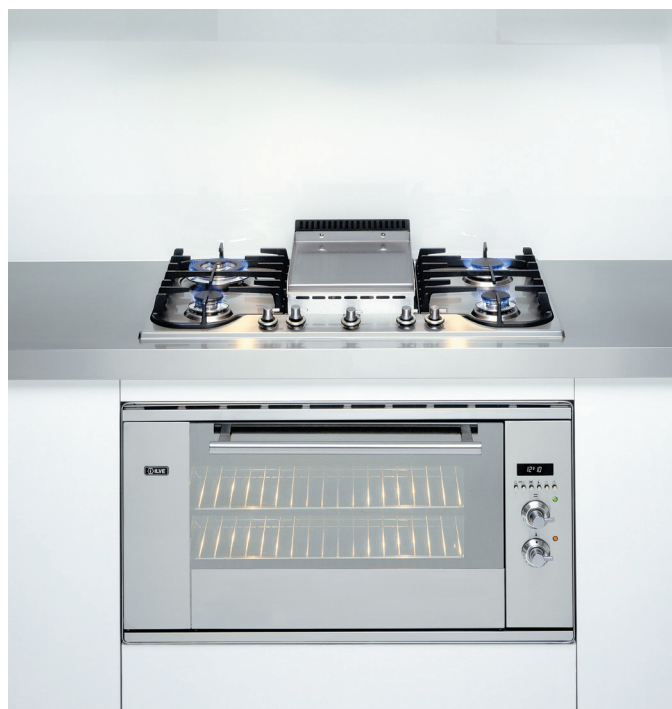
Pictured: • 948SXMP Oven • H90FCVX Cooktop