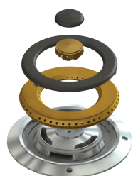
Pictured: ILVE Brass Burner