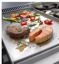
Pictured: ILVE Tepanyaki Plate

With ILVE Gas Cooktops, you can simmer at the lowest temperatures that your recipe calls for or go to searing heat instantly. With infinite precision heat settings you'll have perfect cooking control. Cleaning is easy! There are fewer food trapping cracks and crevices allowing for easy wipe maintenance. The trivets, burner caps and supports are removable and easily cleaned either in a dishwasher or by hand. A stainless steel finish ensures this cook top will co-ordinate beautifully with the design of other ILVE appliances. ILVE have maintained their core values as a family owned business and continue to manufacture appliances that represent the most pure thing in a family – dinner time! The kitchen is, and should always be, a place and a time where the family meets and shares.