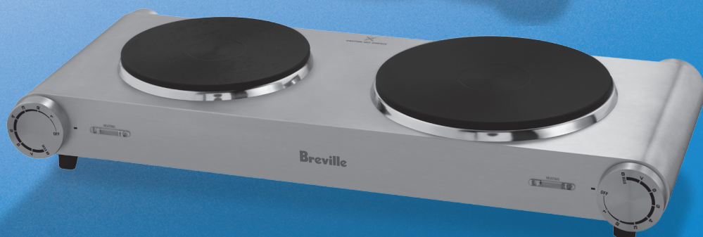
BHP150 • BHP250 Hot Plates