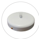
Off-white coated rose