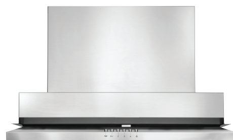
Pictured: VAPORE - 60cm induction hood