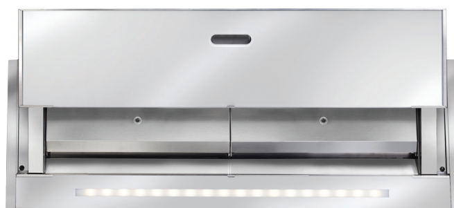
Pictured: VAPORE - 90cm under side open