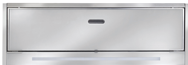
Pictured: VAPORE - 90cm under side

VAPORE is the first built-in hood in the world with the ability to avoid condensation that inevitably is created on surfaces and filters of a traditional range hood when it is installed over induction cooktops. Unlike the gas cooktop, induction cooktops only heat the receptacles that contain food and not the surrounding air, therefore the hood surfaces remain cold.