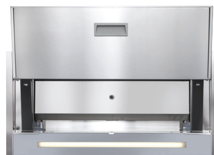
Pictured: VAPORE - 60cm under side open