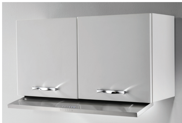
Pictured: VAPORE - 90cm Induction Hood