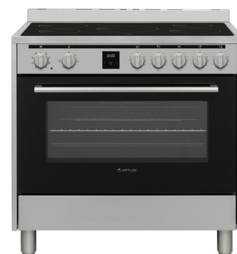
AFI902X in Stainless Steel