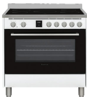
AFI902W in Gloss White