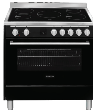
AFI902B in Gloss Black