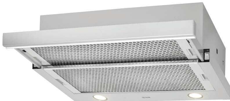
Pictured: CS60 - 60cm Slideout Hood

The CS Series is a Built-in hood with 2 speeds. Available in 2 different sizes and anti print mark Stainless Steel panel. Incorporating easy glide telescopic rails which provide greater extraction surface.