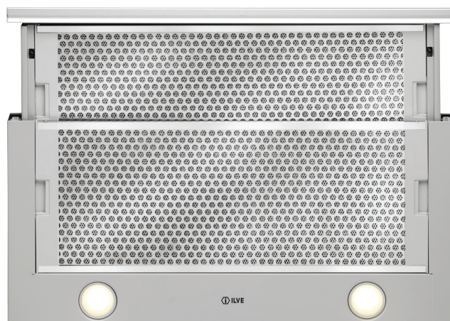
Pictured: CS60 - 60cm Slideout Hood: under side