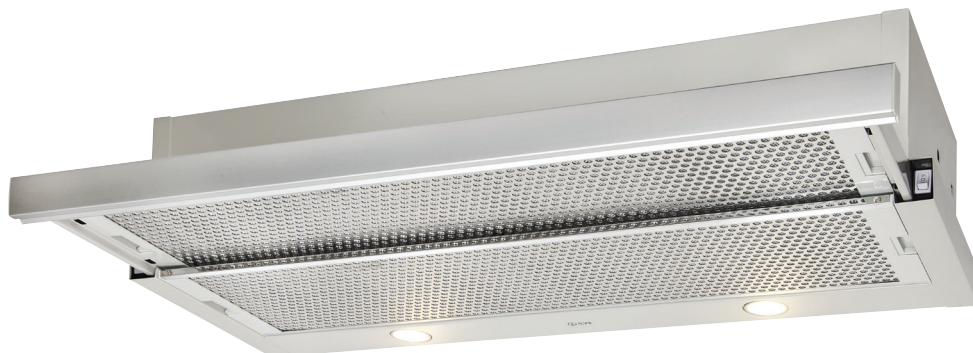
Pictured: CS90 - 90cm Slideout Hood