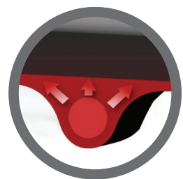
CAST-IN HEATING ELEMENT