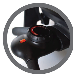
TRIGGER RELEASE TEMPERATURE CONTROL PROBE