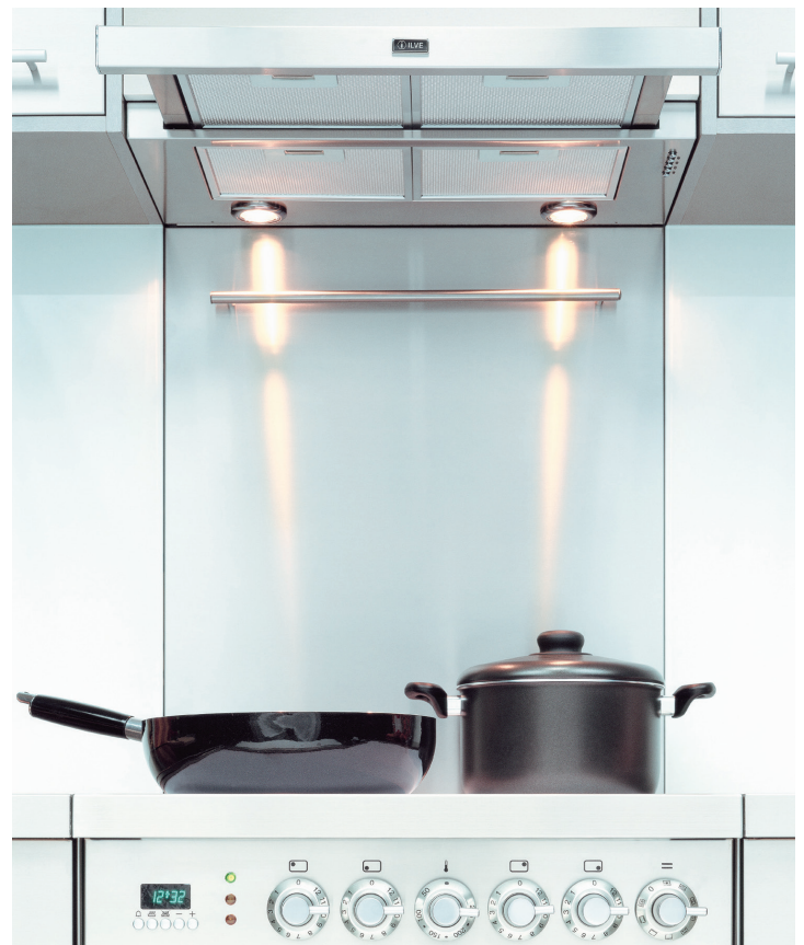
Pictured: • CAL60 - 60cm Slideout Rangehood