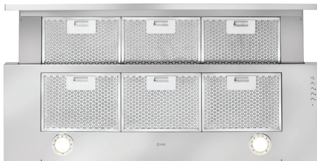
Pictured: CAL90 - 90cm Slideout Hood

We all adore the scrumptious smells that billow from your favourite dishes in the kitchen, but not when those smells become stagnant within the home. ILVE's rangehoods are designed to stealthily keep your kitchen fresher and cleaner. ILVE rangehoods craftily stand above the rest. Their powerful high speed fan removes cooking odours, smoke and vapour from the kitchen, while extremely fine filters trap all grime. It features intelligent auto fire shut-down sensors and a filter cleaning reminder light. The smart timer function can be set for an automatic turn off leaving you to your culinary masterpiece at hand. In-built LED Lights produce a natural brightness, illuminating your cooking area while the streamlined electronic control panel ensures whisper quiet air extraction is at your fingertips. Either as a visual focal point or discreetly integrated, it is easy to see that ILVE Rangehood's are built to extract!