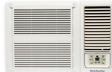
KWH39HRE, KWH53HRE, KWH62HRE