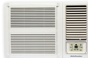
KWH39CRE, KWH53CRE, KWH62CRE