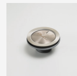
AC28 Basket Waste