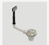
AC10 Basket Waste with Rectangular Overflow