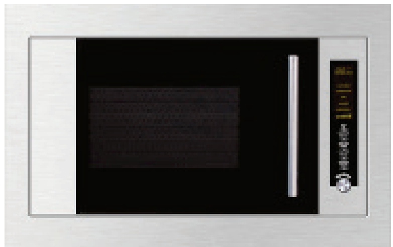
Pictured: IV600FSCM Microwave and IV600TK Trimkit (Trimkit sold separately)

Perfect partners, our stainless steel microwave is designed to match perfectly with your choice of ILVE oven. Simple to use and made of the finest materials, with stainless steel used internally, this microwave is easily cleaned and maintained. Because microwave oven units are usually fitted to supplement the built in oven, it is especially important that they match in design and colour. ILVE appliances are renowned for forming a perfectly integrated family of built in appliances. That's why this microwave comes with an optional trim kit to build in with your choice of ILVE oven.