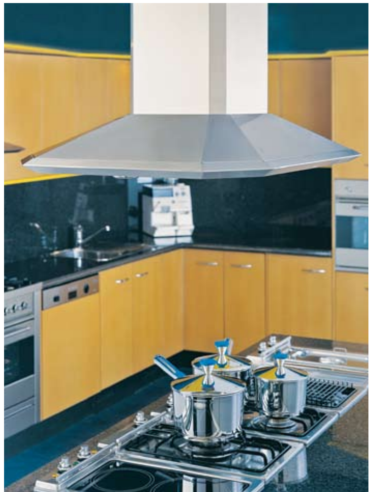
Pictured: • X300 Island Hood

ILVE's Island rangehoods are designed to stealthily keep your kitchen fresher and cleaner. ILVE Island rangehoods craftily stand above the rest. Their powerful highspeed fan removes cooking odours, smoke and vapour from the kitchen, while extremely fine filters trap all grime. It features intelligent auto fire shut-down sensors and a filter cleaning reminder light. The smart timer function can be set for an automatic turn off leaving you to your culinary masterpiece at hand. In-built Halogen Lights produce a natural brightness, illuminating your cooking area while the streamlined electronic control panel ensures whisper quiet air extraction is at your fingertips. Either as a visual focal point or discreetly integrated, it is easy to see that ILVE Rangehood's are built to extract!