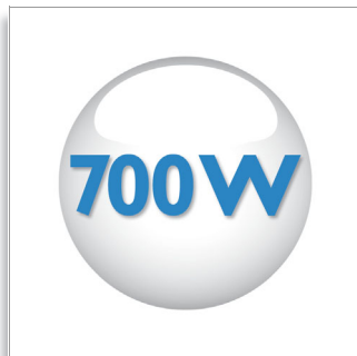
Powerful 700 W motor