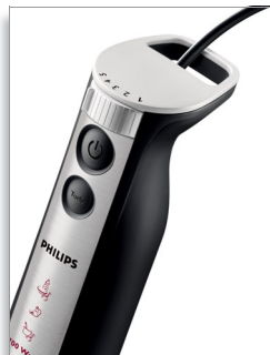
Multiple speeds and turbo button