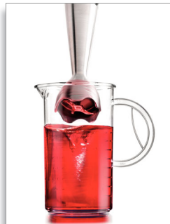
Anti-splash blade guard