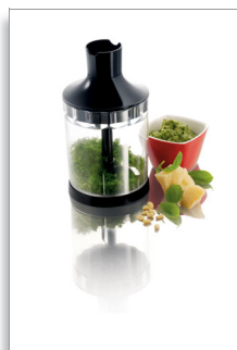
XL chopper accessory for chopping large quantities