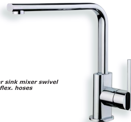
KE2030 single lever sink mixer swivel spout, with 1/2" F flex. hoses