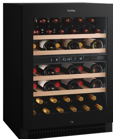
Underbench Wine Cabinets and Beverage Centre VWS820SCB, VWD820SCB, VBS820SCB