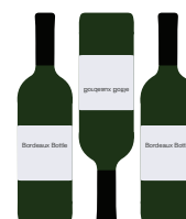
Capacity based on Bordeaux Bottles