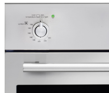
Cooking modes on control panel with symbol & words