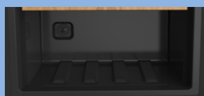
Internal fan & activated charcoal filter

LCD display and touch screen controls for each temperature zone